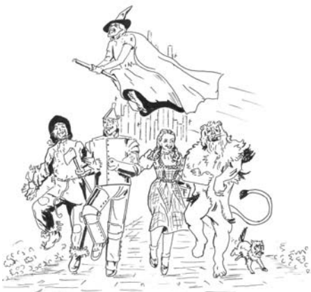
Follow the Yellow Brick Road to COC to find the Wizard

Non-Profit Org. U.S. POSTAGE PAID PERMIT NO. 273 SANTA CLARITA, CA