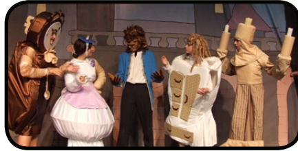
Beast and Company

with four public performances - 2PM & 7PM July 15 and July 17. The musical adventure this summer